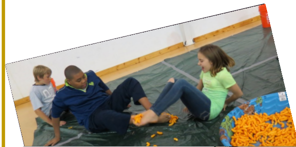
Cheese-Toes Game on Wednesday, November 16.

If you think church is boring - think again.